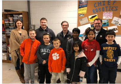
Team Roboguppies (grades 3-4)