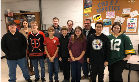
Team Aqua-Pups (grades 5-7)