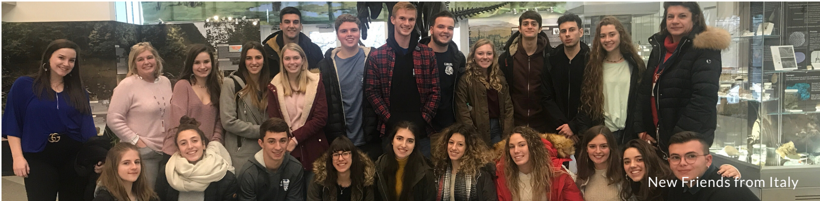
New Friends from Italy